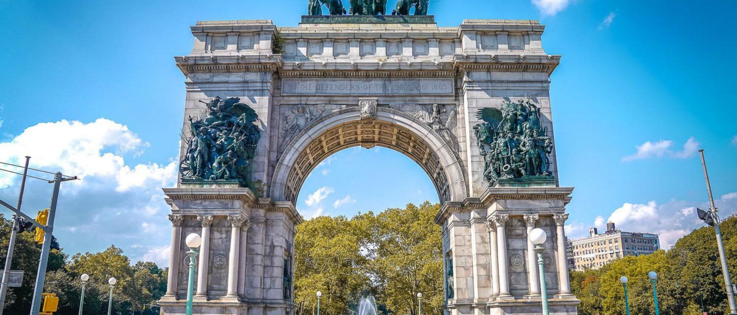
Grand Army Plaza at Prospect Park Brooklyn, NY