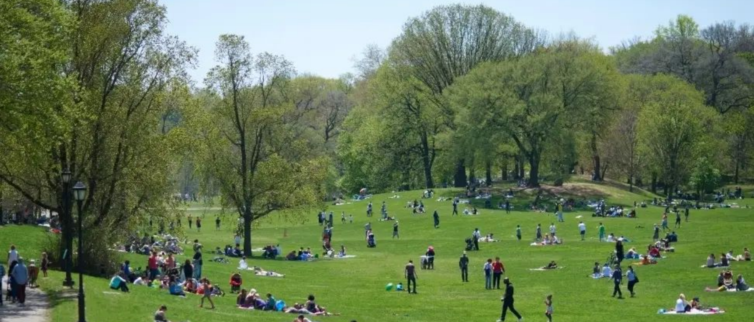
Northern end of Long Meadow near Battle Pass, Prospect Park