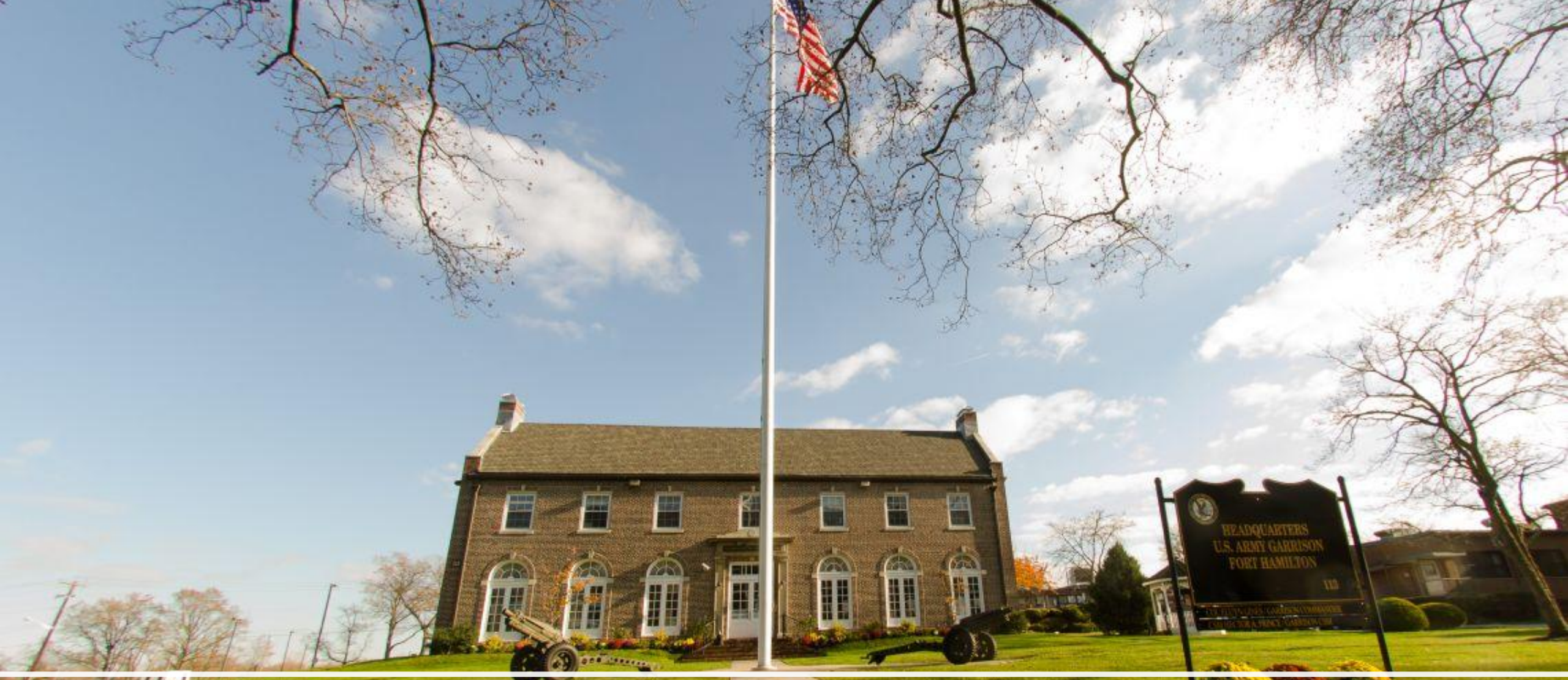
Headquarters, Fort Hamilton, Brooklyn, NY