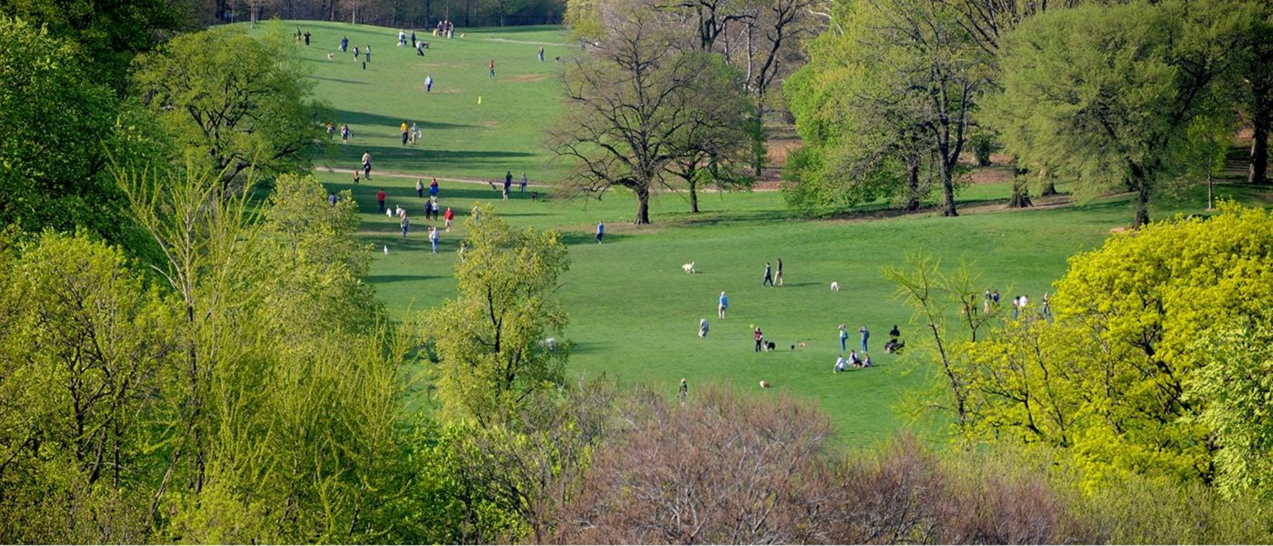
The Battlefield at Long Meadow, Prospect Park